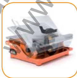
Tilting table (0° to 45°).