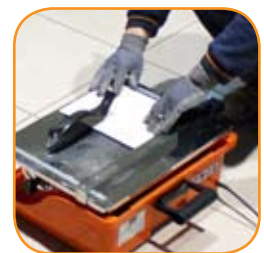
Precise cutting guide.