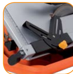
Fast and precise locking cutting device.