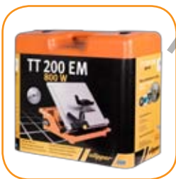
Easy transportation and storage.